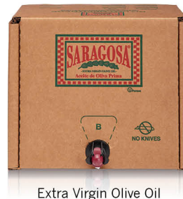
Extra Virgin Olive Oil

Product #03630 – Sauté Blend (30% EVO, 70% Canola Oil)