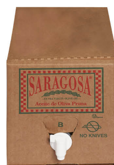
Extra Virgin Olive Oil