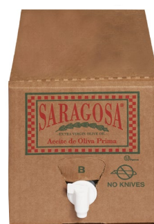
Extra Virgin Olive Oil