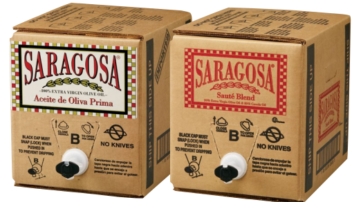
Extra Virgin Olive Oil