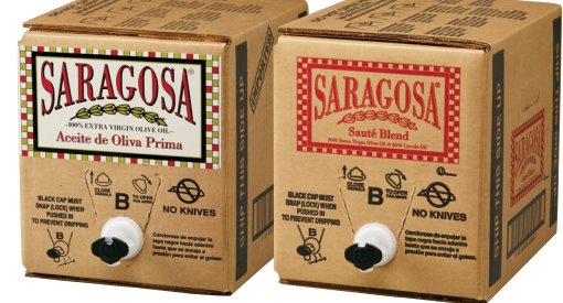
Extra Virgin Olive Oil

Product #03625 – Extra Virgin Olive Oil Product #03630 – Sauté Blend