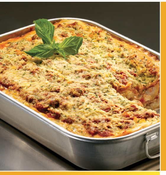
Vegalene® Food Release Sprays

Premium Foodservice Products Crafted For Your Success