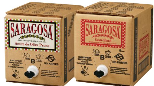
Extra Virgin Olive Oil