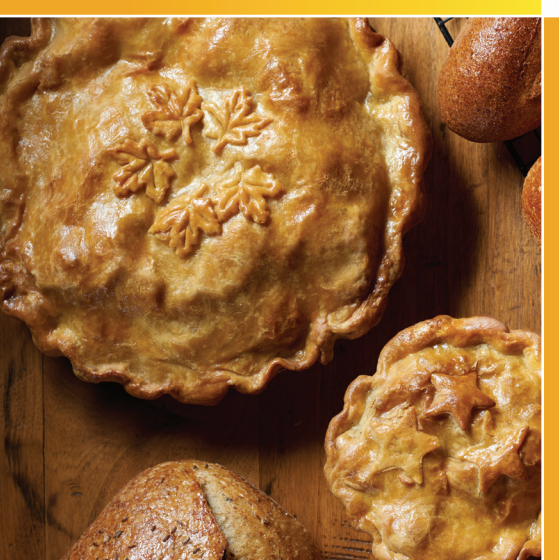
Bak-klene® Bakery Sprays & Egg Wash