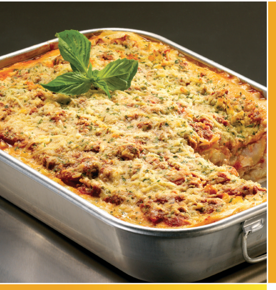
Vegalene® Food Release Sprays

Premium Foodservice Products Crafted For Your Success