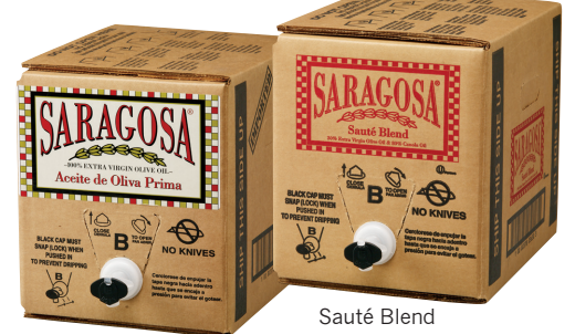
Extra Virgin Olive Oil

Product #03625 - Extra Virgin Olive Oil Product #03630 - Sauté Blend