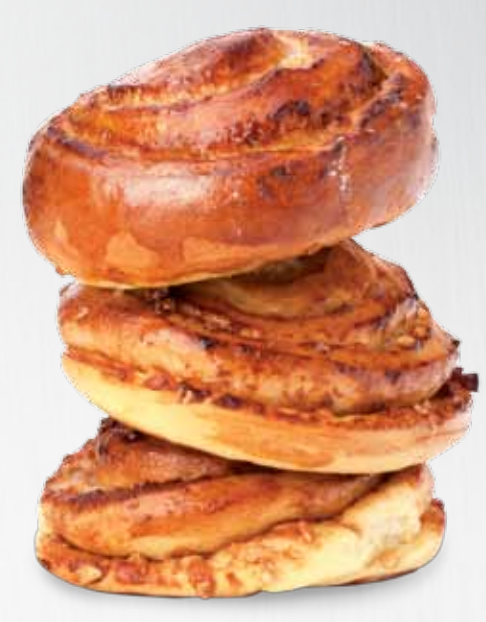
Bake-Sheen<sup>®</sup> Glaze and Adherent is ready-to-use and requires no refrigeration. Great for browning or adding shine to breads, rolls, pies and nutrition bars.

Par-Way Olive adds an olive oil flavor to a variety of prepared foods such as pizza dough, breads, pasta and vegetables.